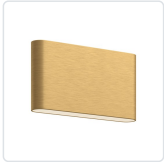
AT6510-BG Brushed Gold